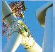
ERECTION OF WTG