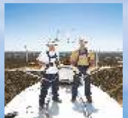
OPERATIONS, MAINTENANCE AND SERVICES (OMS)