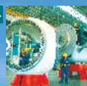
PROCUREMENT, MANUFACTURING, PRODUCTION AND LOGISTICS