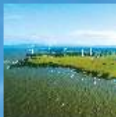
SITE INFRASTRUCTURE DEVELOPMENT