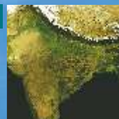
WIND ASSESSMENT SURVEY