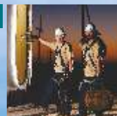
HAND OVER / TAKE OVER (HOTO) AND OPERATIONS