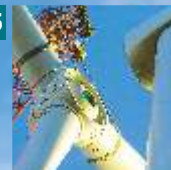
ERECTION OF WTG