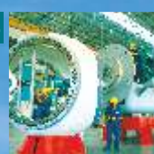
PROCUREMENT, MANUFACTURING, PRODUCTION AND LOGISTICS