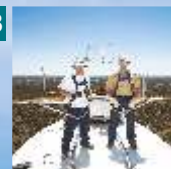
OPERATIONS, MAINTENANCE AND SERVICES (OMS)