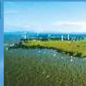
SITE INFRASTRUCTURE DEVELOPMENT