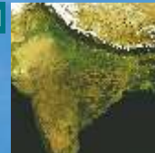
WIND ASSESSMENT SURVEY