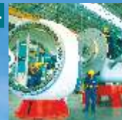
PROCUREMENT, MANUFACTURING, PRODUCTION AND LOGISTICS