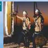
HAND OVER / TAKE OVER (HOTO) AND OPERATIONS