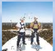
OPERATIONS, MAINTENANCE AND SERVICES (OMS)