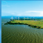
SITE INFRASTRUCTURE DEVELOPMENT