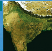
WIND ASSESSMENT SURVEY