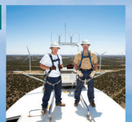
OPERATIONS, MAINTENANCE AND SERVICES (OMS)