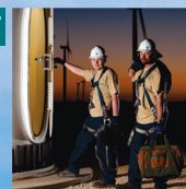
HAND OVER / TAKE OVER (HOTO) AND OPERATIONS