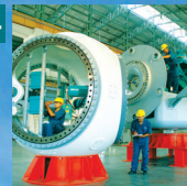
PROCUREMENT, MANUFACTURING, PRODUCTION AND LOGISTICS