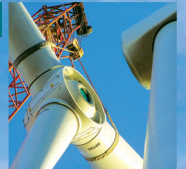
ERECTION OF WTG