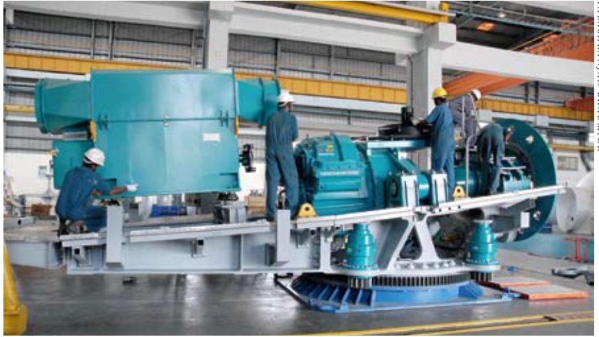
Looking to the future with gusto

A year ago, Suzlon commissioned its next generation WTG, the S111-90 m 2.1 MW, of 111 m diameter rotor of 2.1 MW rating, atop a 120 m tower and designed for low wind sites. Over 300 MW of these turbines have been sold and 30 MW installed. It can generate 20 per cent higher energy compared to the S97-120 m 2.1 MW model, of which the company has sold over 800 MW and installed 330 MW since its launch in November 2014. Both these WTGs now constitute 75 per cent of Suzlon's orders. The S97-120 moreover generates 10 per cent more electricity than the previous $97-90 at the same site conditions.