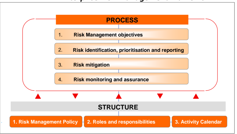
Enterprise Risk Management Framework