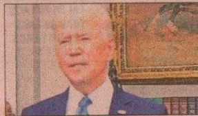
US President Joe Biden